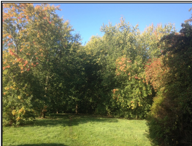
The woodland location previously proposed for the conference centre

I'm writing this on the warmest February day ever recorded. A bit worrying, maybe, but something to enjoy as the world around us comes to life again and the signs of spring emerge. A theme of this newsletter is our shared activity to protect and enhance the appearance of the area in which we live, our streets and nearby open spaces, which we are so fortunate to have.