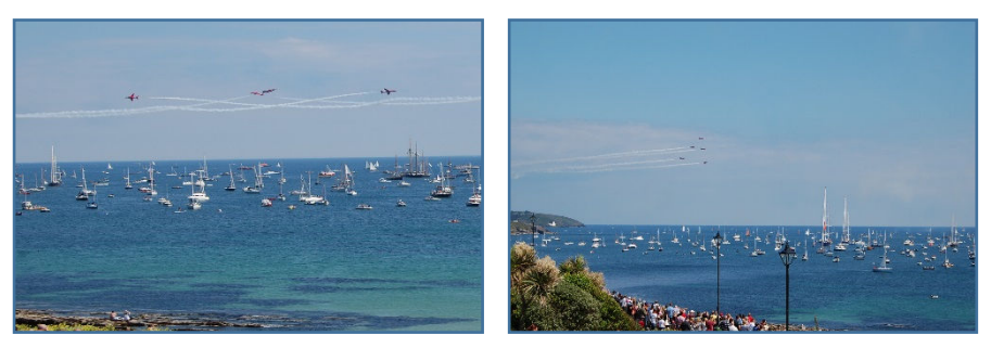
Red Arrows off Gyllyngvase Beach, May 2014